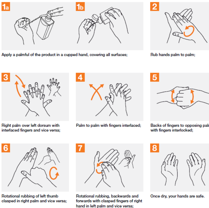
Figure 1 – Image from the World Health Organization (WHO)’s Hand Hygiene: Why, How and When? (WHO, 2009)

A portable handwash station can be made using a table, container with a hands-free spout, and a five-gallon bucket. Wastewater caught in the five-gallon bucket should be poured down a drain. Be sure to keep soap and paper towels stocked at all handwashing facilities.